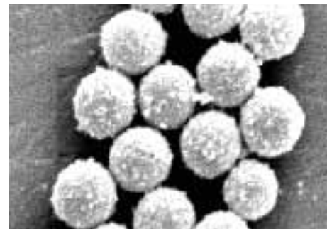
Figure 1 SEM Photo of Spherotech Cat. No. CM-30-10 (Carboxyl Magnetic Particles, 2.5% w/v, 3.36µm, 10 mL). at 5000x.

One type of magnetic microparticles manufactured by Spherotech is paramagnetic. They are prepared by coating a layer of iron oxide and polystyrene onto monodispersed, polystyrene core particles. As a result, the magnetic particles are spherical in shape, uniform in size, and paramagnetic in nature. Their uniformity is shown in Figure 1 . The iron content of these magnetic particles can be adjusted. However, in general, iron represents about 10% to 15% of the particle. Due to their iron content they are easily separated from a suspension using a SPHERO™ Magnetic Separator. In addition, they resuspend when removed from a magnet since no detectable magnetism is retained even after repeated magnetic field exposure. Their magnetism is utilized as a rapid, efficient means for separating the beads from the supernatant without centrifugation.