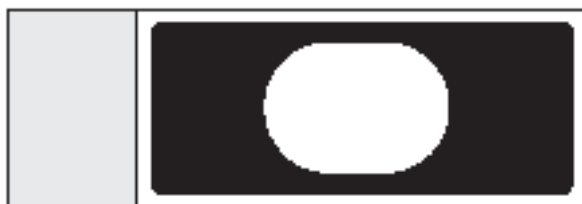
Standard 25 mm x 75 mm x 1 mm slide used during the manufacturing of 17 x 24 mm oblong, single well fluorescent particle slides.